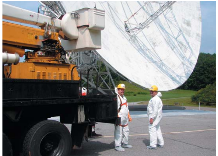
It took two weeks for two men to paint both 26-meter radio telescopes and “Smiley.”