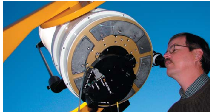
The new West Optical observatory features a state-of-the-art clamshell and a 16-inch DFM telescope.